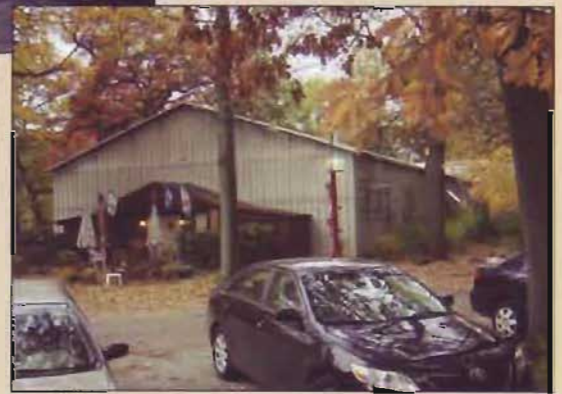
Front and side today.