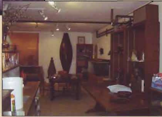
Now a dining room.