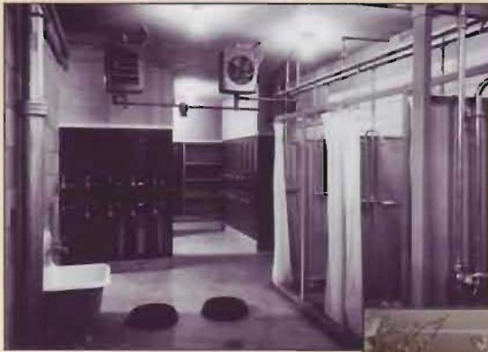
Locker room looking north then.