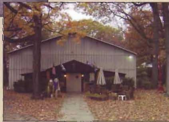
Front entrance today.