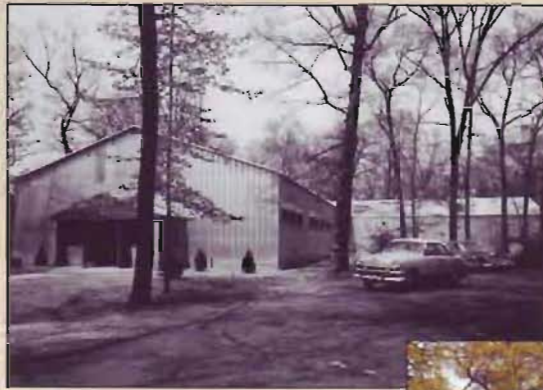
Front and side in late '50s.