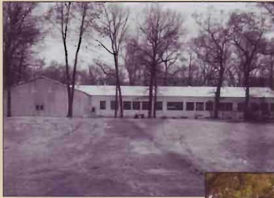
South side then.