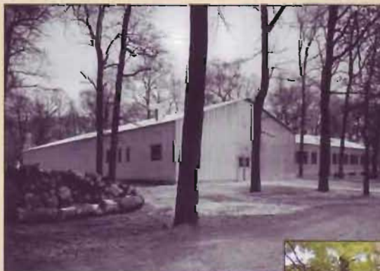
Lakeside back entrance then.