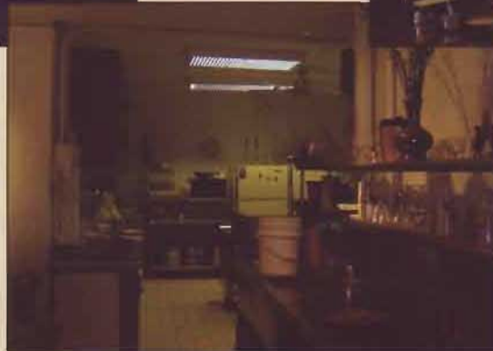
Now a kitchen.