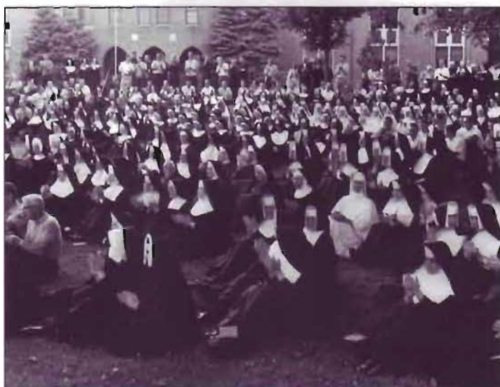
Sisters from various communities gather on the front lawn during a summer school hootenany in 1964.