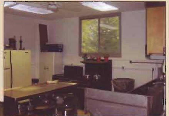
More of the kitchen.