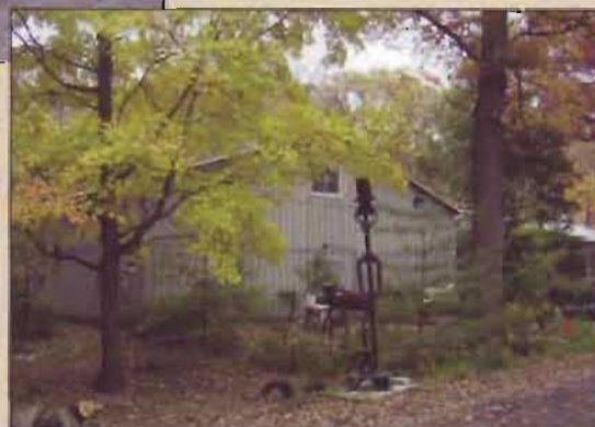
Lakeside back entrance now.