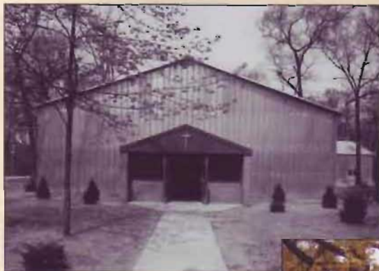
Front entrance in late '50s.