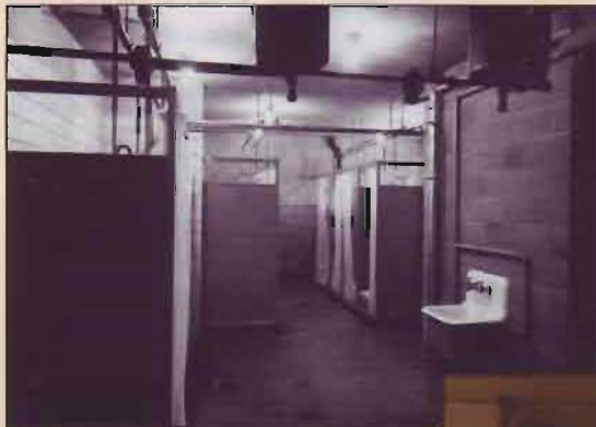
Shower room looking south then.