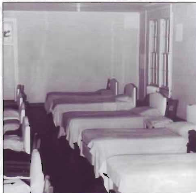
Freshmen and Sophomore dorms.