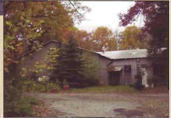
South side today.