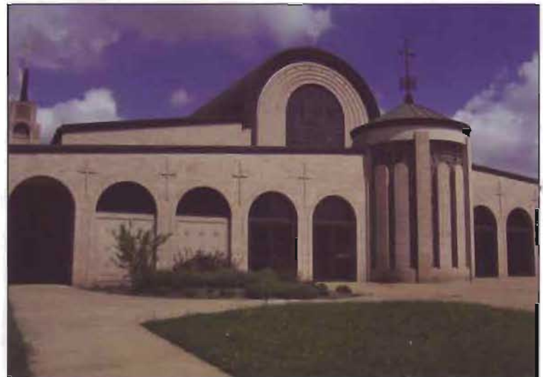
St. Ignatius Parish church.