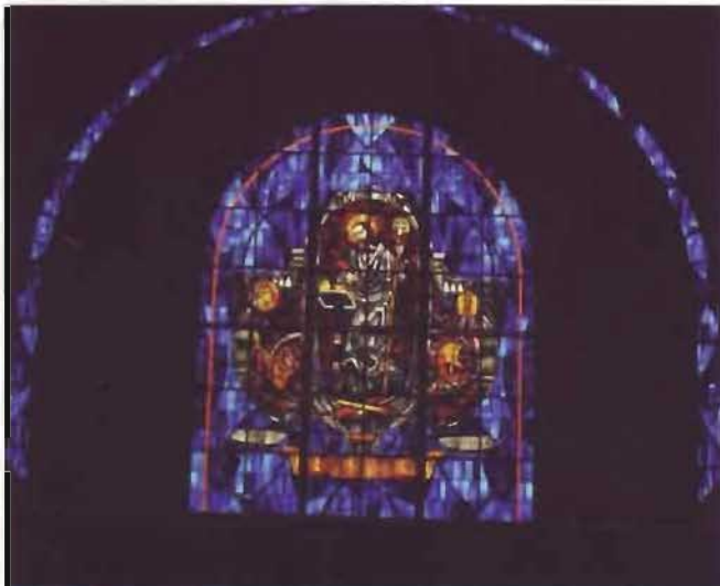
Large Rose window in St. Ignatius.