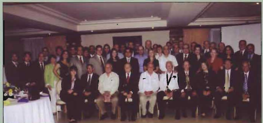
The Fighting Irish of Panama.