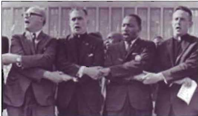
Fr. Hesburgh and Martin Luther King, Jr.